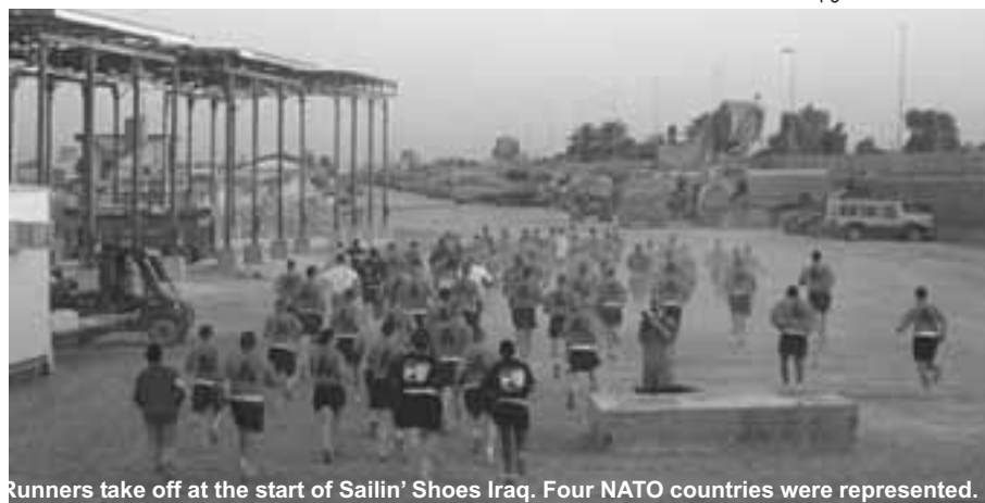
Runners take off at the start of Sailin' Shoes Iraq. Four NATO countries were represented.