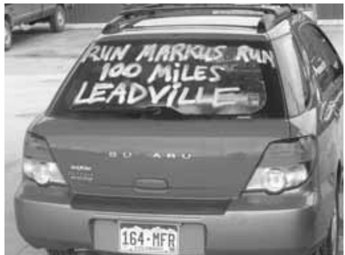
One of the many creative expressions of support found on the more accessible portions of the Leadville 100 course. Without the huge community of friends, runners, and volunteers, many would never attempt the challenge.