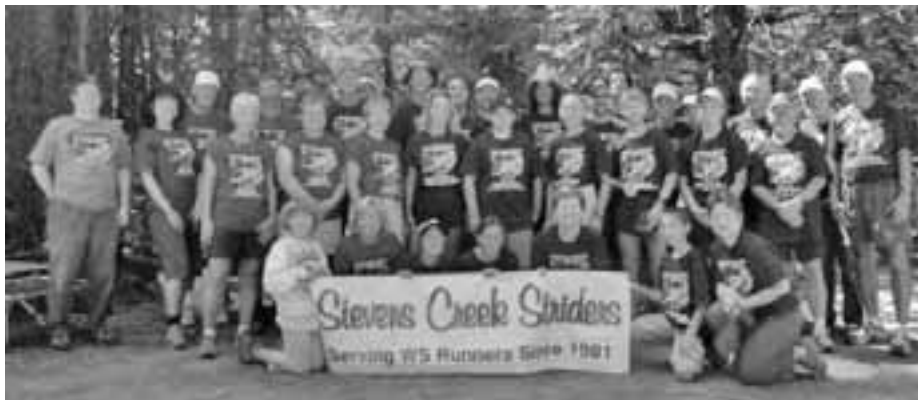
Aid station crews have a long and proud history at most 100 mile endurance runs.

Buena Vista's 22nd Autumn Color Run takes place Saturday, September 16th. Spend a wonderful weekend running a great race in the crisp autumn air and enjoying the incredible fall foliage scenery. Choose between a half marathon, a 5K and 10K. A long sleeved micro fiber running shirt is included for all participants. Please see the enclosed registration form and www.fourteenernet.com/colorrn for more details.