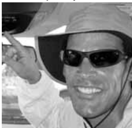
Dean Karnazes points to 130 degrees showing on a gauge during the 2003 Badwater ultra, where he placed 2nd. So why is he smiling?

When you read his book you will learn that fanatic is quite possibly an understatement. For weeks after his 30th birthday all-night run he was "nearly incapacitated from