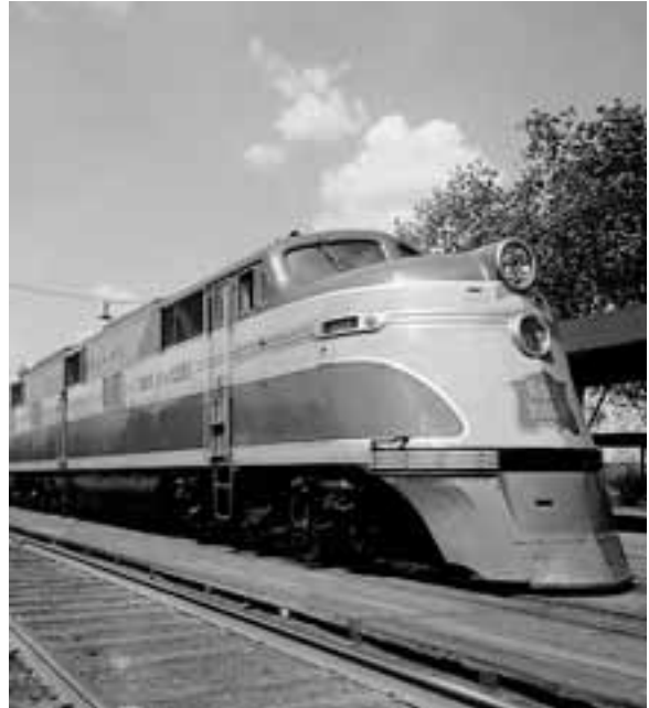
The sleek Rock Island Rocket engine was the (TA 606) steam locomotive by General Motors, generating 1200 HP, came into service in 1937.