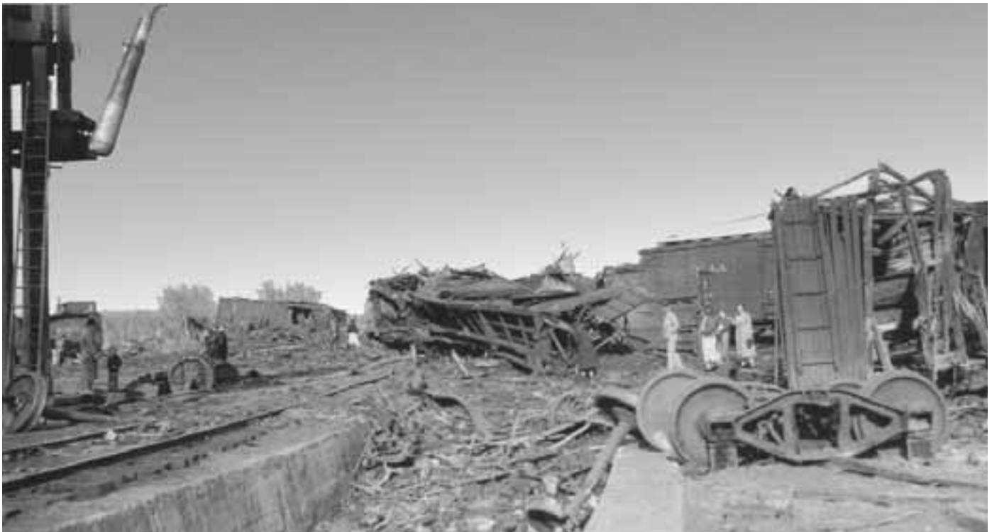
Photo of the 17-car 1938 runaway train from Falcon, which crashed after crossing Monument Valley Creek. Fortunately, warnings were issued in plenty of time for people to clear the area and escape injury.

a caboose in the process of getting connected for an east-bound journey actually rolled away from Falcon—the brakes were not adequately set! Yikeses!!!! Slowly and surely these loaded (heavy!) 17 freight cars with caboose rolled away and quickly picked up speed as gravity tugged them westward. An alert crew and station agent at Falcon quickly contacted the Roswell station master and warned of this impending and dangerous arrival. It was hoped the rollaway might not have had the momentum to crest a small hill at Elsmere. But it easily did and