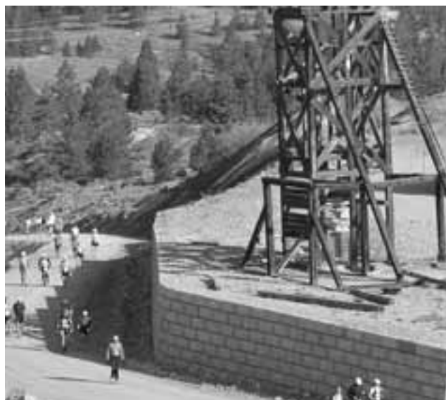
A huge mining structure dwarfs runners early in the course, which passes through the heart of the Leadville historic mining area.