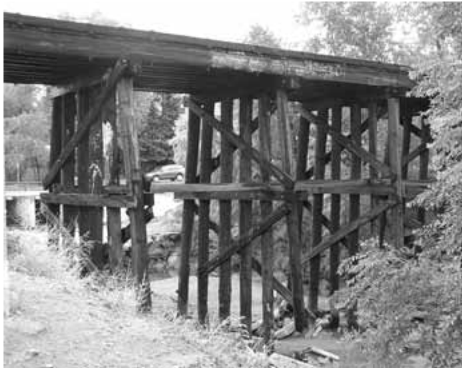
The sturdy trestles of the Rock Island Railroad, shown here as seen from the running trail, have stood the test of time as they bridge Sand Creek, east of Academy and south of Constitution.