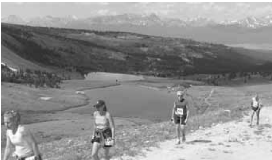
At about mile 11 and 12000', marathoners trudge steadily upward through alpine meadows east of Leadville against the backdrop of the Sawatch Range. Mt. Elbert stands just right of center.