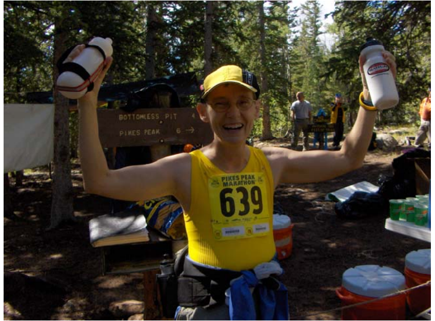
Runner 639 runs the Pikes Peak Marathon with an attitude—recovering from a double mastectomy, and, a chemo treatment the Thursday prior to race day.