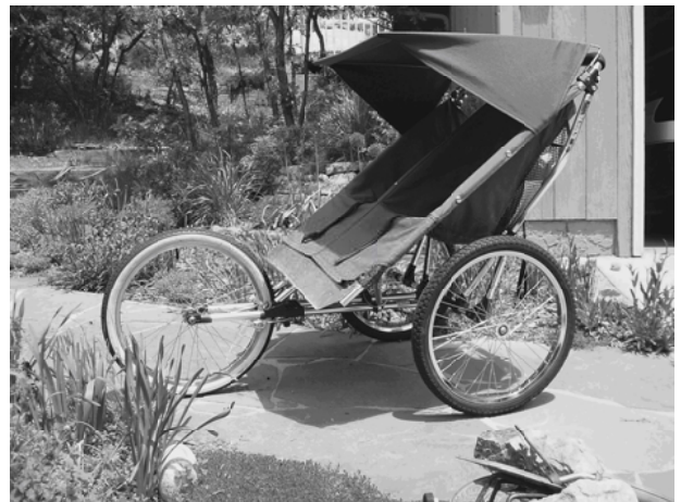
Gently Used. New tubes. Sunshade. $ 250

All wheels on both strollers are quick release.