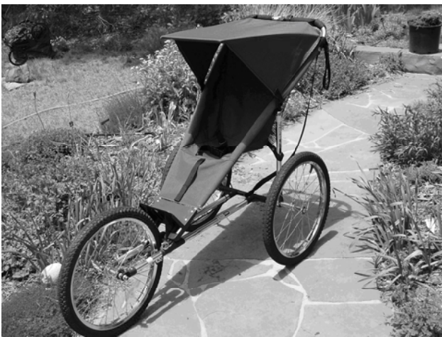
Excellent condition. Sunshade. $ 150