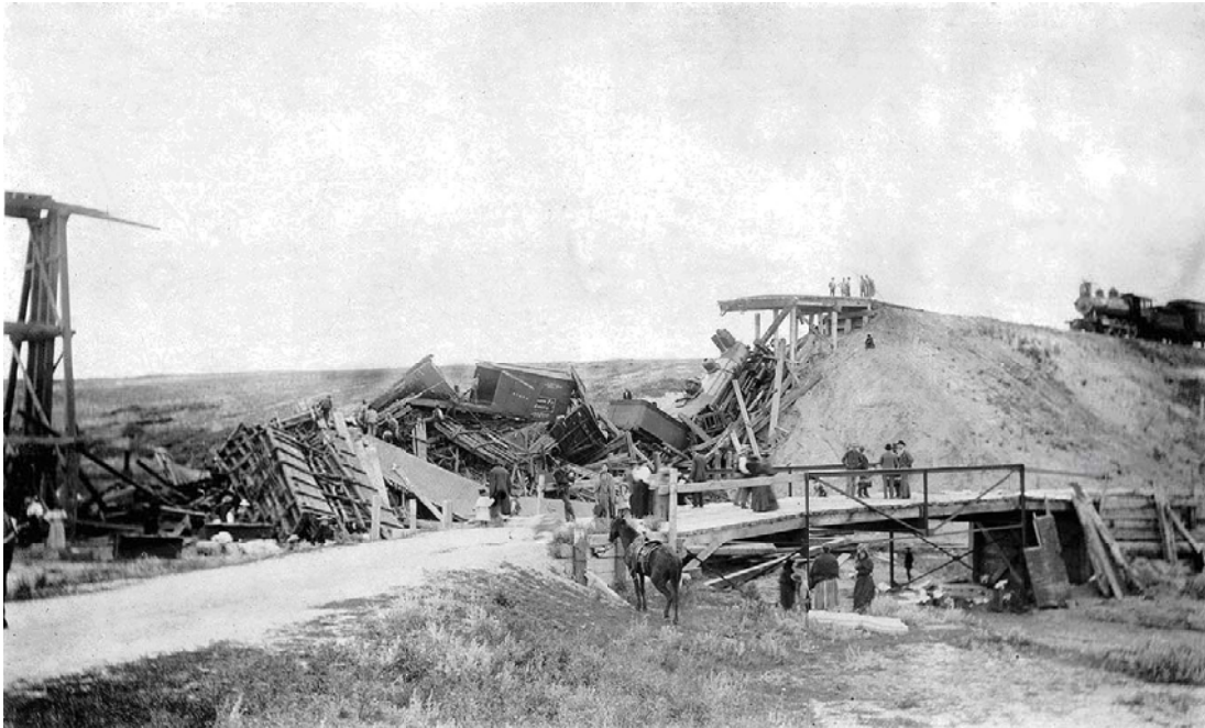
The great Santa Fe train wreck July 17, 1895 occurred about ¼ mile south of 2nd Street/Beacon Lite Road-viewing southeast.