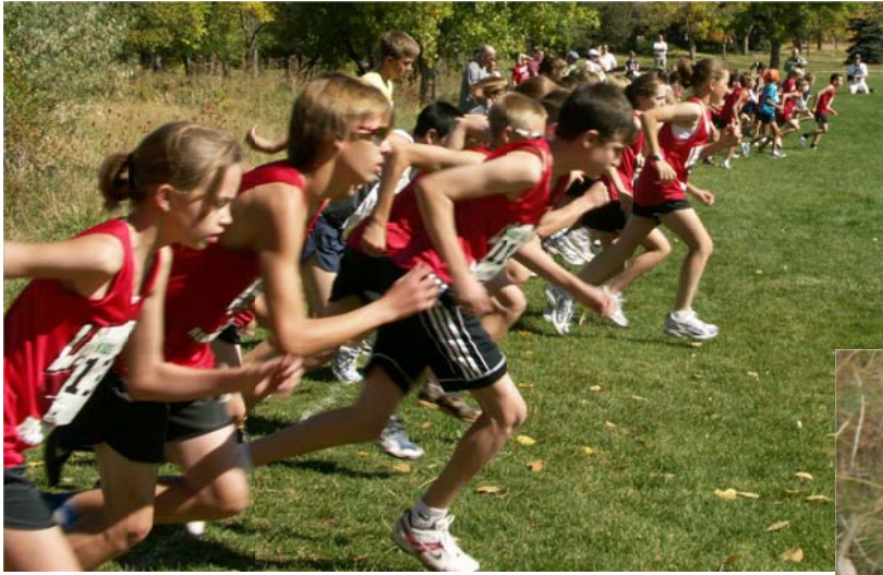
Finish line volunteers, big kids race start and climbing the ropes!